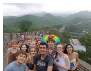
Some members of #BYC on the Great Wall of China