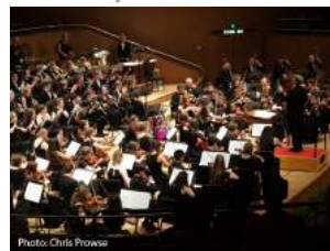
#BYSO on-stage in Shanghai