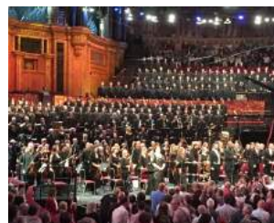
The Proms Youth Choir, featuring 23 members of #BYC, at the end of the penultimate night of the Proms concert