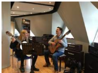
Guitar Festival Masterclass