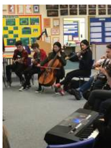
Learn it Live!