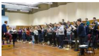
BYC with BBC Singers at Maida Vale